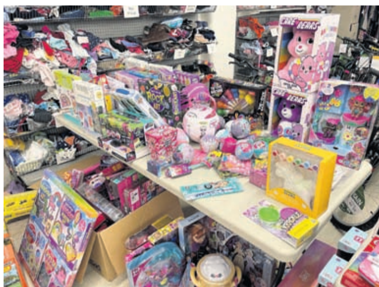
In this photo provided by the Salvation Army, toys donated after a Salvation Army van loaded with $6,000 worth of toys for children was stolen earlier in the week are shown Saturday, Dec. 18, 2021 in Farmington, N.M.

Also Friday, a meeting including representatives of 14 countries, various international organizations and Haitian Prime Minister Ariel Henry produced broad commitments to address security and the political and economic situation in the impoverished Caribbean nation, according to a top U.S. diplomat. □